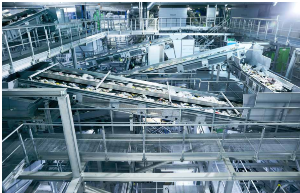
ReVise-UP increases the recycling of post-consumer plastic packaging waste.

The “ReVise-UP” research project, coordinated by the Department of Anthropogenic Material Cycles at RWTH Aachen University, involves eight partners from academia and industry.